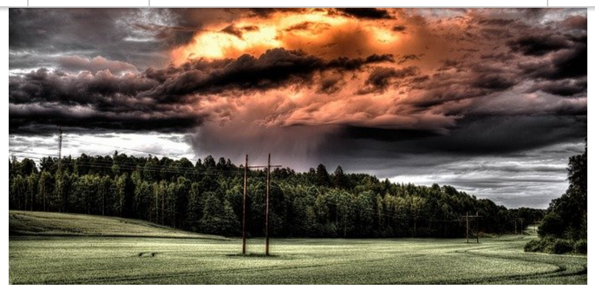
This video would be a good introduction to any lessons around precipitation, flooding, landslides, or drought. It would also be a good way to discuss how satellites help us monitor weather (precipitation) globally.