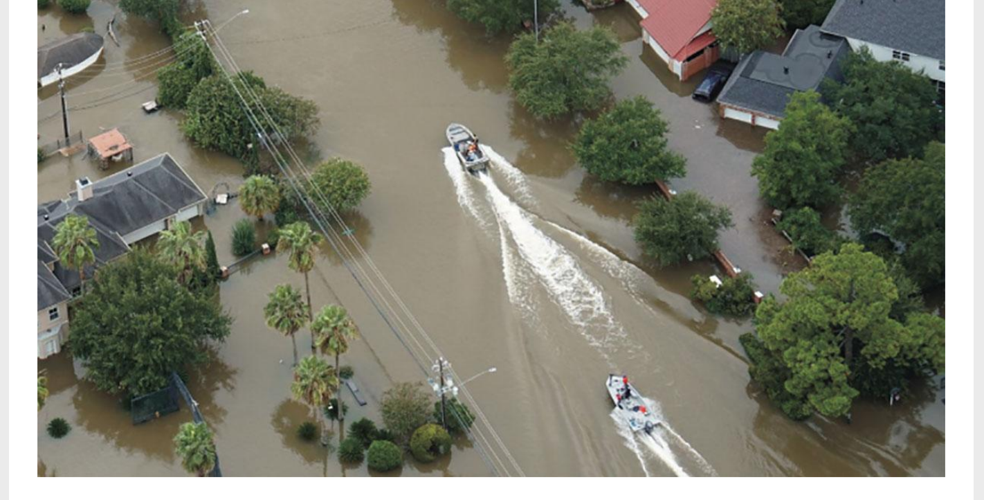
Activity: Major Storms and Community Resilience

Audience: College, Graduate/Professional